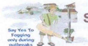
Say Yes To Fogging only during outbreaks