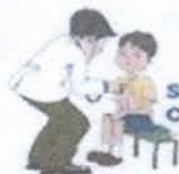
Seek Early Consultation