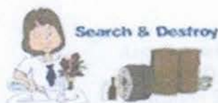
Search & Destroy

Para di maipunan ng tubig at pamugaran ng kiti-ki: